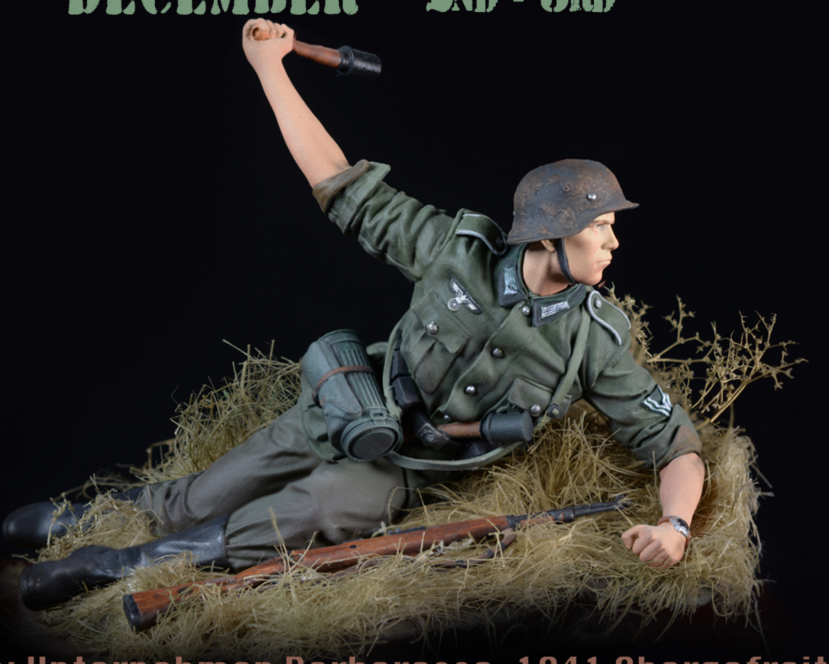
Figure: Unternehmen Barbarossa, 1941 Obergefreiter Size: 1:16 scale