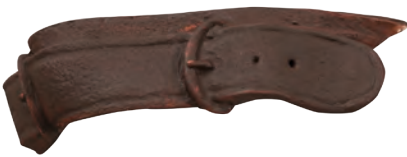
The base colour for the belt is a deep brown.

For the first shadows, the colour must be very thin and applied in several coats for smooth transitions. Adding black ink to the first shadow mixture, I obtain a dark colour that I use for outlining and reinforcing shadows.