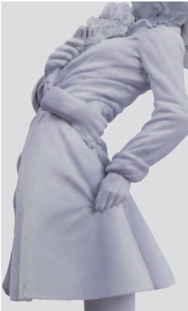
Base colour applied by airbrush following same steps as the sailor.