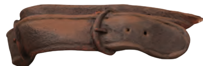
The second highlight is applied in a stippling motion with a paintbrush.