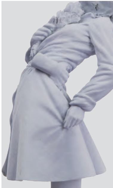
Although the primer is white we emphasised highlights on uniform folds using matt white XNAC-01.