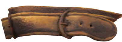
First shadow applied.