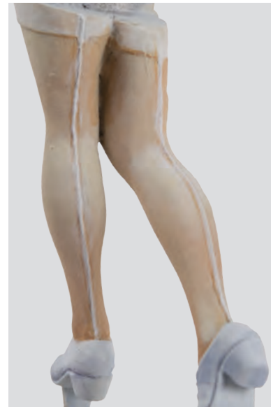
We paint the shoes and stocking seams. Once the legs are glued to the body we check the degree of transparency and add touches of white or flesh tone to the stockings as necessary.