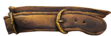
In a very dark colour, I outline the seams and holes in the belt.