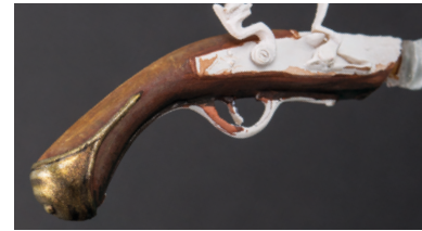
To finish, I apply two shadow tones.