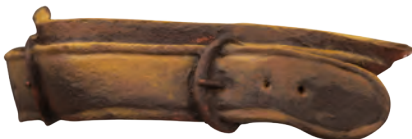
The final lights mark the edges clearly.