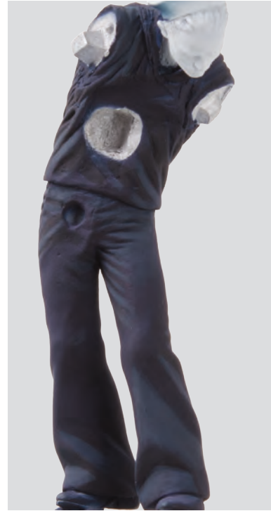
After finishing the shading we remove the blu-tack and finish off by hand the unpainted areas.