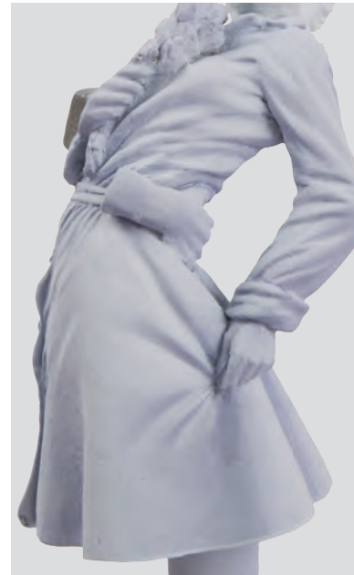
We add shadow to areas furthest from daylight sources.