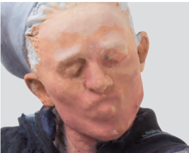
Skin base tones are a blend of the lower face colour with light tones added to the front parts.