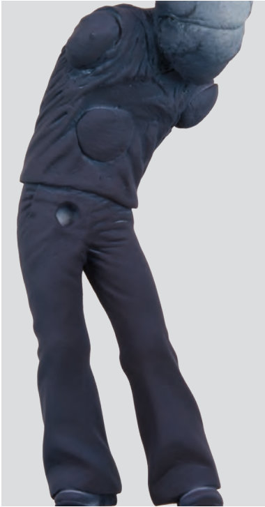
Base colour applied with airbrush, painting from below upwards so that paint fills into the crevices.

The facial gestures appear strange until the figures are joined together whereupon both faces are perfectly unified into the kiss.