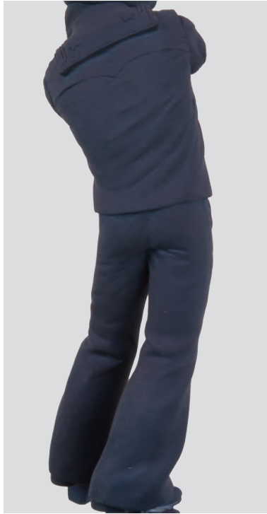
In the other direction we apply highlights of overhead light, gently enhancing folds.