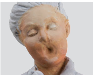
The face base colour was the same as for the sailor, blending the 1st light tone on the front areas with the base colour of the rest of the face.