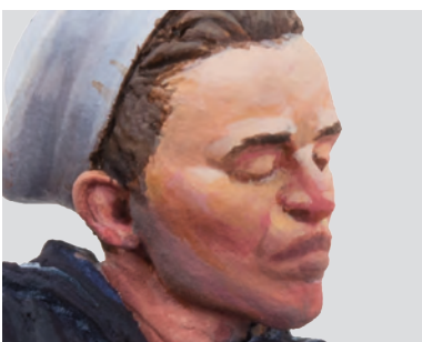
Face details completed; hair painted with No.2 Brown set (ACS-013) with touches of No.6 from the same set for shadows.