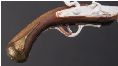
Gilt metal base colour. Combining metal pigments with inks, the result is highly realistic.