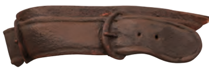
First light step.