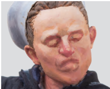
We paint the front parts with 2nd light (see colour chart) and the rest of the face with 1st light.