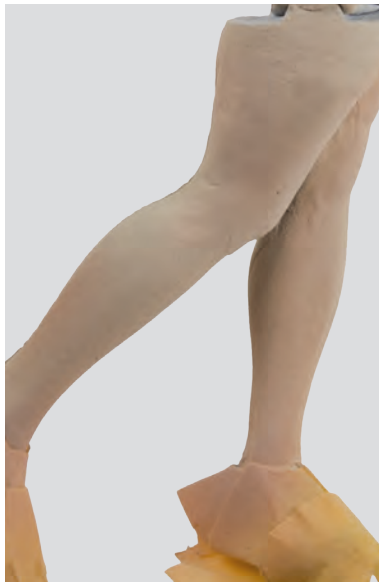
Now we apply a general light spray to the leg surfaces using No.3 from the White set (ACS-003).