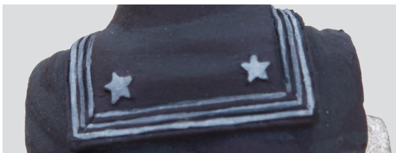
Detail of the uniform, the lines and stars are clearly defined and present no problems to painting. We used No.3 from the White set (ACS-003) + No.3 from the Non-metals set (ACS-012).