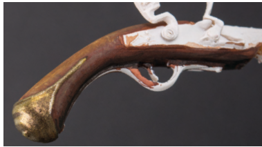
Appearance of the metal surface with three light steps.