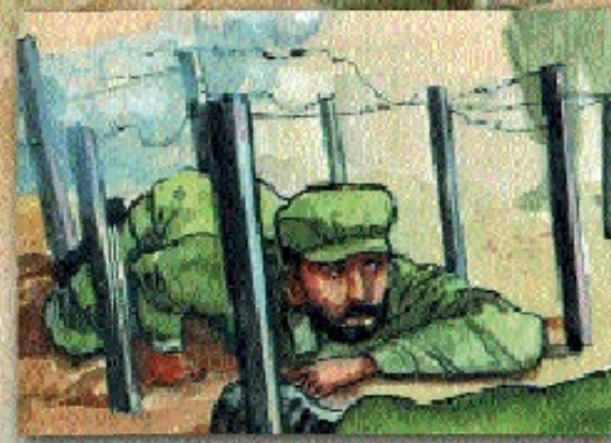
Physical fitness is essential in any military activity.