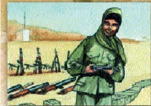
The Mujahidin must have a deep understanding of light weaponry.