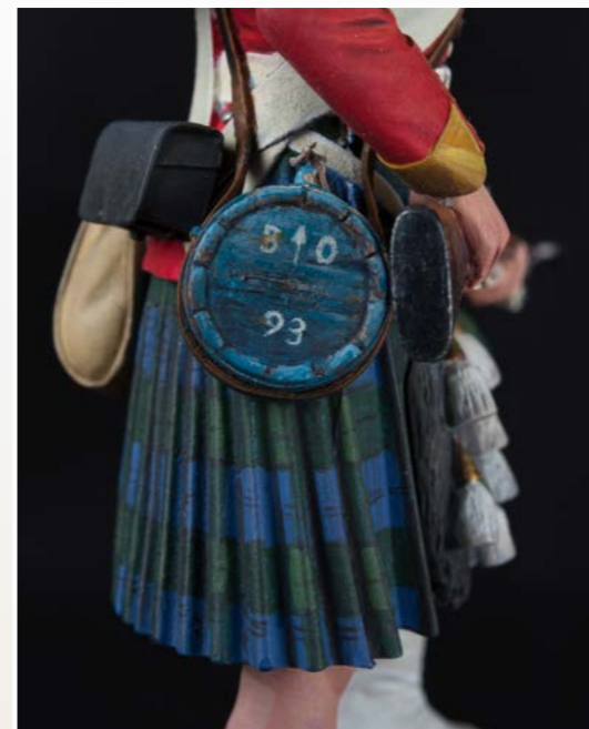
The canteen is made to look like wood, and painted over irregularly in blue.