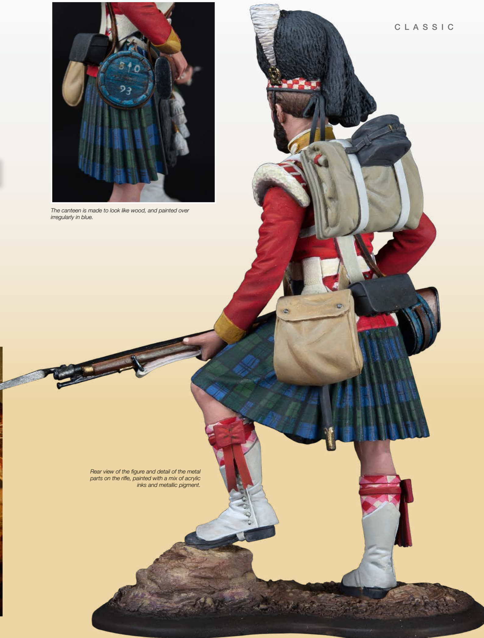
Rear view of the figure and detail of the metal parts on the rifle, painted with a mix of acrylic inks and metallic pigment.